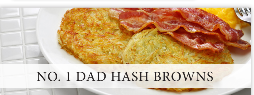
Inspired by Food Network